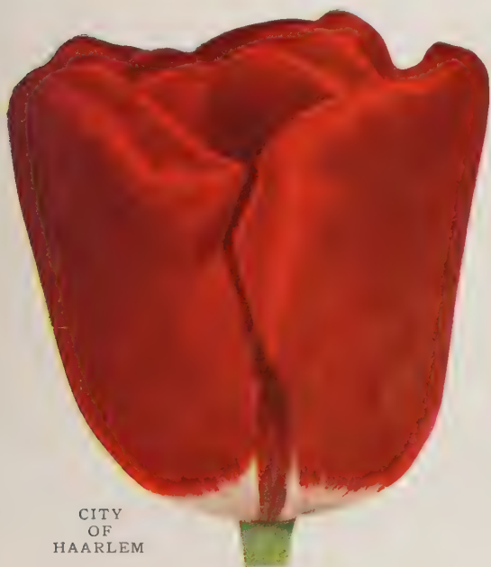
CITY OF HAARLEM